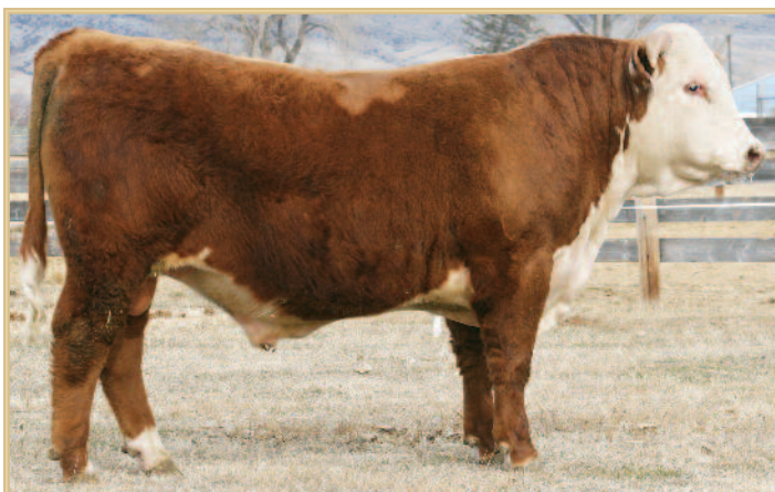
CL 1 Domino 297Z