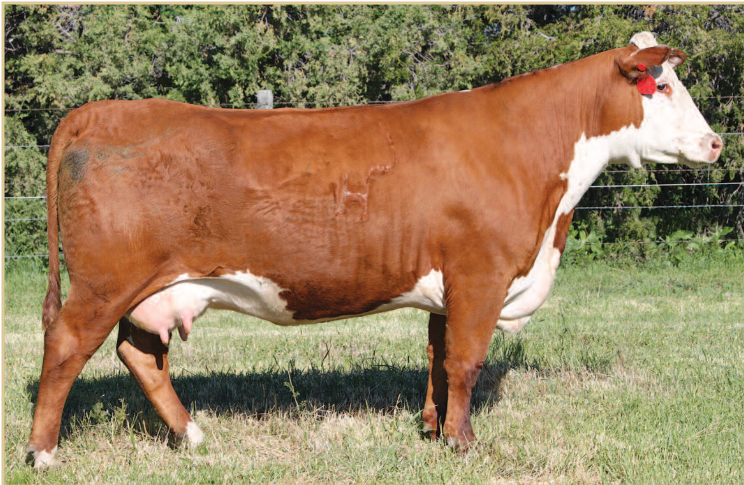
HH Miss Advance 7109T