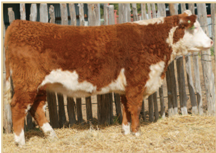
FS Miss Advance 342A