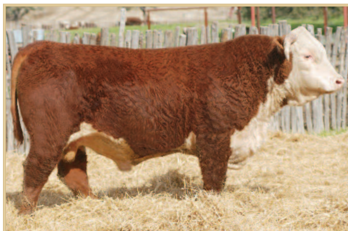
FS Advance 3001A ET