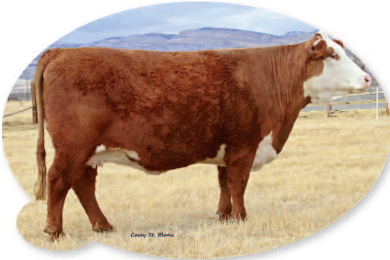
CL 1 Dominette 606S 1ET

Dam of the five "Pick of the Flush" yearling ET heifers