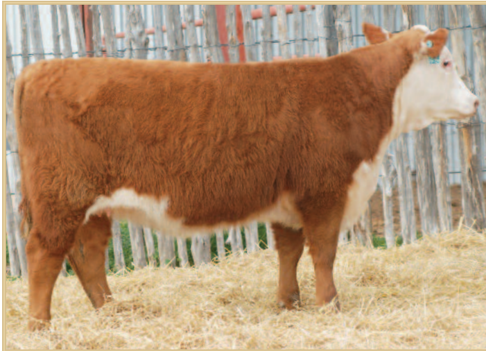
FS Miss Advance 427B ET