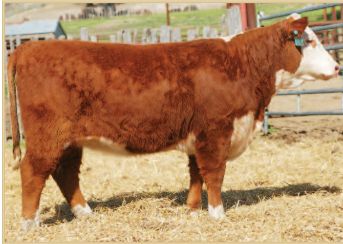
FS Miss Advance 402B