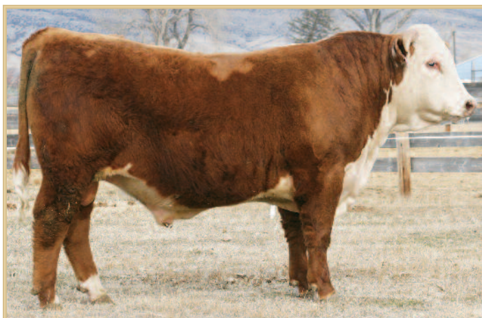
CL 1 Domino 297Z

Sire of the five "Pick of the Flush" yearling ET heifers