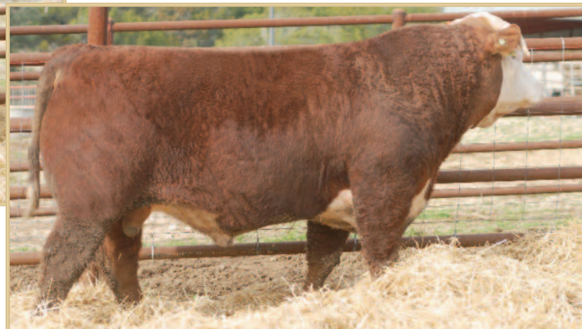
FS Advance 3014A ET