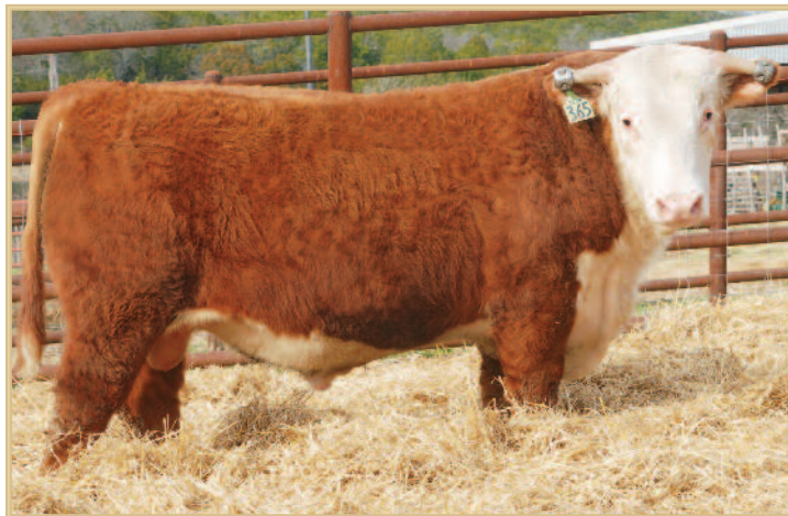
FS Advance 365A

363A is a son of 237Z, the son we raised of our HH Advance 0081X herd sire and the 810U dam that sells. 237Z was a solid red, heavily pigmented heifer bull that we lost early. He passed his smoothness along to 363A. Here is a sure shot, top-notch heifer bull.