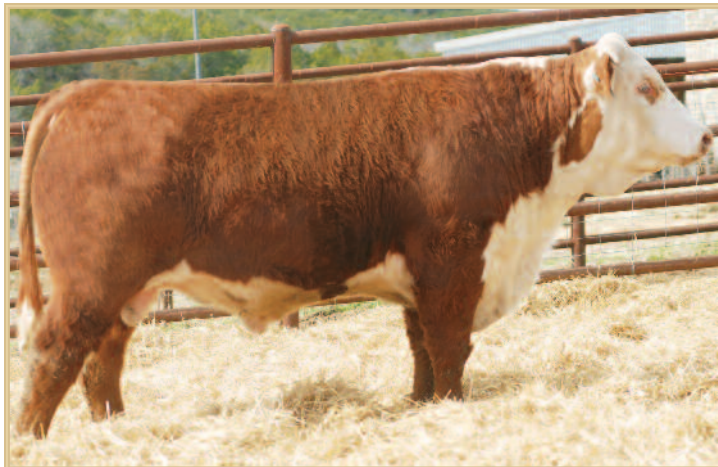
FS Advance 417B