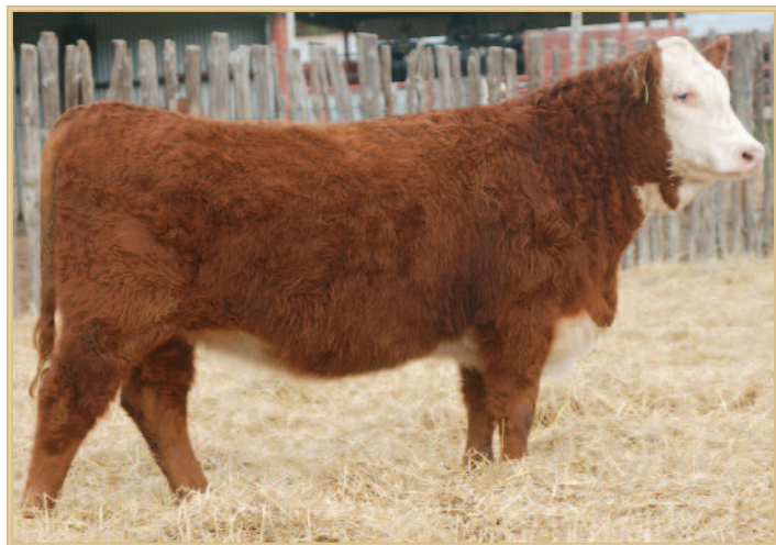
FS Miss Advance 358A

• P.E. Jan. 6 to Mar. 15, 2015 to HH Advance 2214Z.