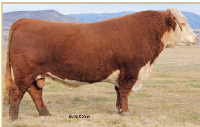
CL 1 Domino 105Y