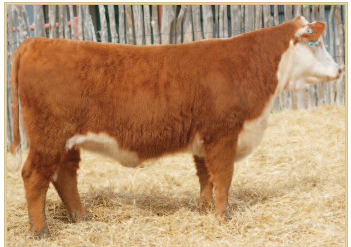
FS Miss Advance 424B ET