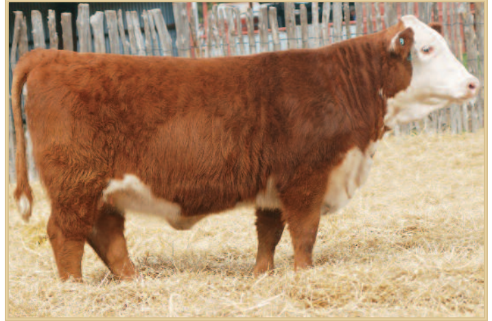
FS Miss Advance 428B ET