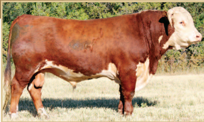
HH Advance 0002X