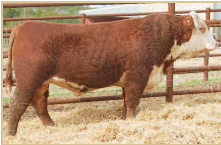
FS Advance 3004A ET

3003A is a top notch HH Advance 1069Y son that has it all—pigment, performance, muscle, power and style. He is long bodied, deep sided and very smooth made. 3003A is the bull that has always caught everyone's eye. Two full brothers also sell.