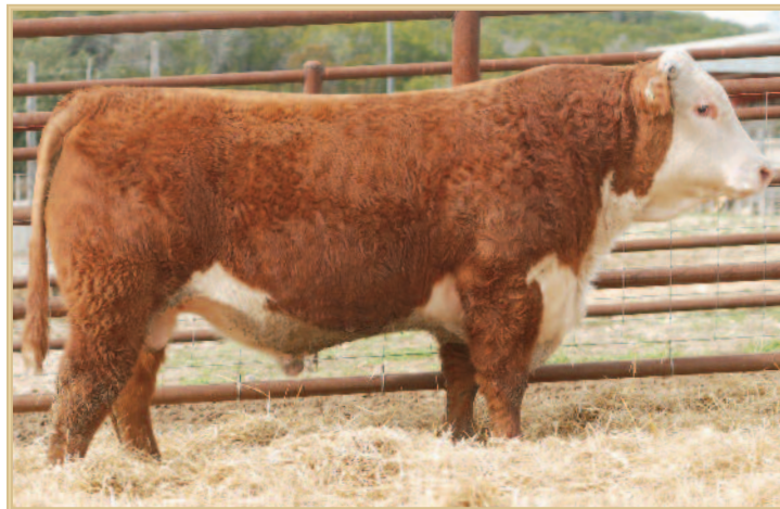
FS Advance 362A

Heavy pigmented, short marked, clean fronted, smooth made 1098Y son out of the CL 1 Dominette 606S donor. He is extra deep and big butted and has great muscle expression. Maternal herd sire prospect that is backed by tons of proven donors and cow families. Full brother sells as Lot 355A. Five maternal sisters sell as a Pick of the Flush.