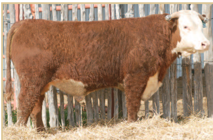
FS Advance 409B

408B is an extra pigmented, dark red power herd bull prospect. He is a fancy, deep, thick made 0081X son that has lots of cow power to back him. Dam sells as Lot 167Y.