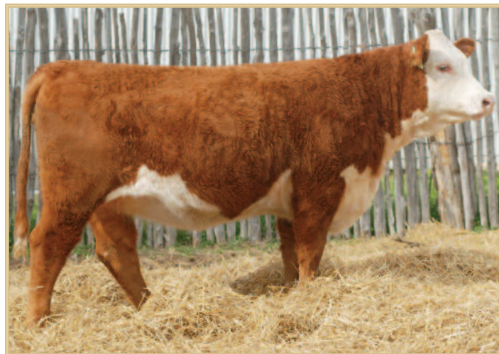
FS Miss Advance 354A