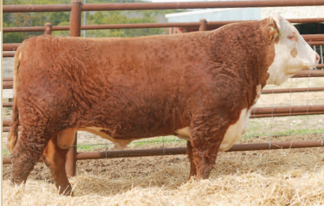
FS Advance 344A