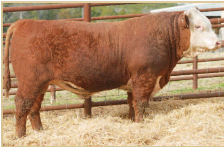
FS Advance 3003A ET