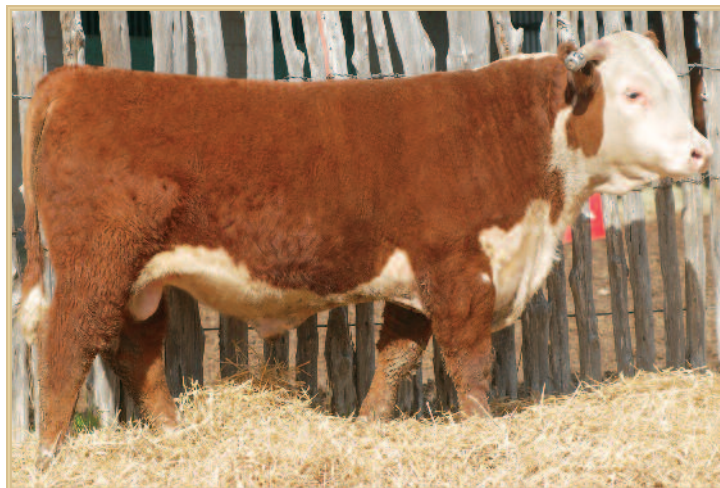
FS Advance 4000B ET