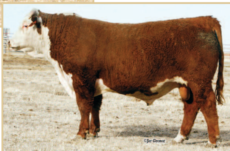
HH Advance 1087Y ET Maternal brother to 9168W

Live on Superior Dish Channel 230 800.431.4452