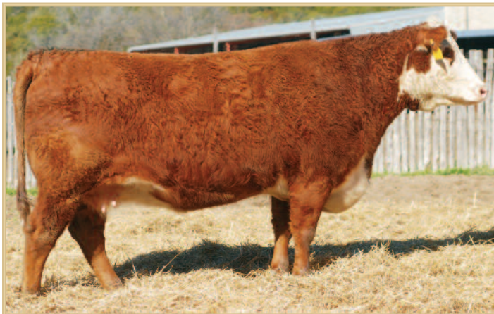
HH Miss Advance 9028W ET

3012A is an HH Advance 0149X son and a top herd bull prospect with fantastic depth of rib, muscle, pigment and fleshing ability. He is super long, fancy and well marked with great EPDs. One of the top bulls in the sale for marbling, he ratioed 132 for IMF. His dam is our 9168W donor that is fancy fronted and deep sided with lots of thickness, pigment and eye appeal. She is a great embryo producer and has produced some of the best females and bulls for us; she sells as Lot 9168W. Two flush sisters to 3012A sell as Pick of the Flush bred heifers.