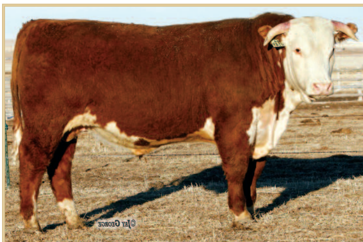
HH Advance 0149X

0081X is a top notch herd bull that combines all the industry demands into a great package. He is deep ribbed and extra thick with outstanding length of body and tons of pigment. 0081X is out of the Holden 5139R cow that topped their 2010 female sale at $40,000 to Haxton Hoffman and then topped Hoffman's 2013 Fall Sale at $175,000. 5139R has produced over $900,000 in progeny sales.