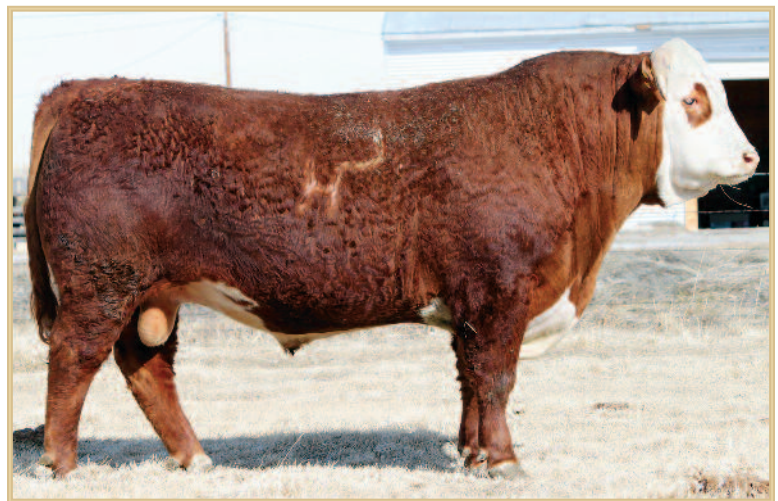
HH Advance 1098Y

Owned with Holden Herefords, MT, and Harrison Land and Cattle, OK.