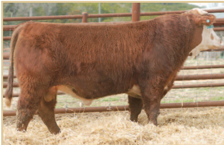
FS Advance 401B