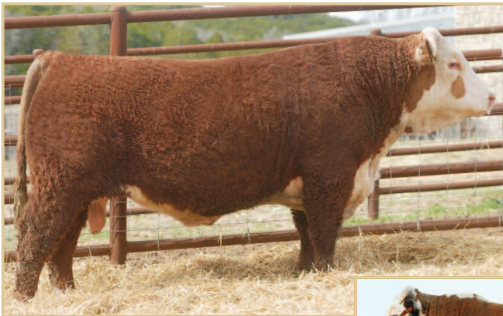
FS Advance 3012A ET This son of 9168W also sells