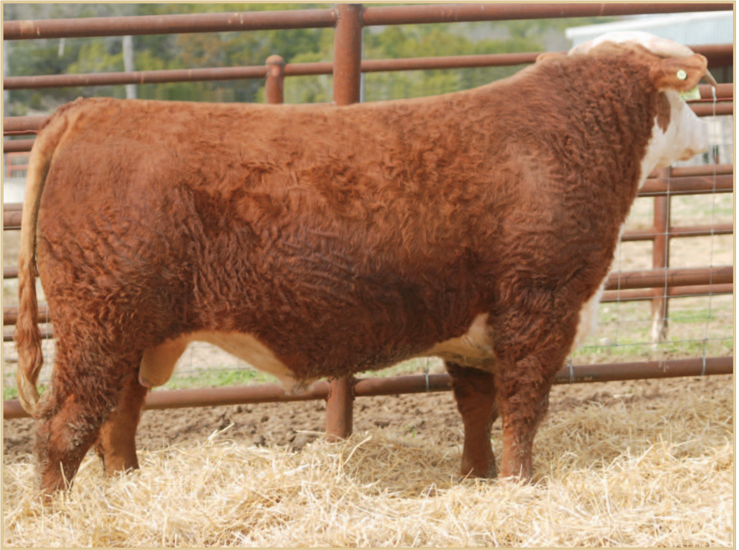
FS Advance 340A