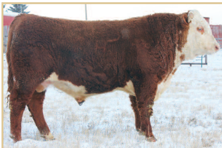
HH Advance 2125Z

2125Z is an outstanding bull that really brings it all together. He is goggle eyed and heavily pigmented, long bodied, deep sided and he has great muscle expression. He is very sound made and has lots of eye appeal. He has a great set of EPDs and had an 80 pound actual birth weight. His dam is a perfect uddered young cow with goggle eyes, and his granddam is the 4016P cow that sold for $37,500 in Holden's 2010 cow sale. His great granddam is the great 0023K cow that was a superior donor for Holden.