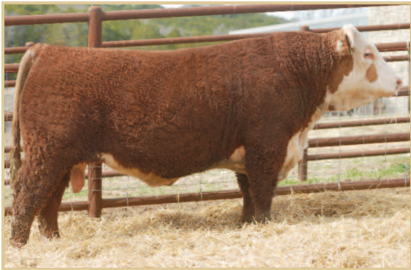
FS Advance 3012A ET

Flushmate brother to 3005A & 3007A...he also sells