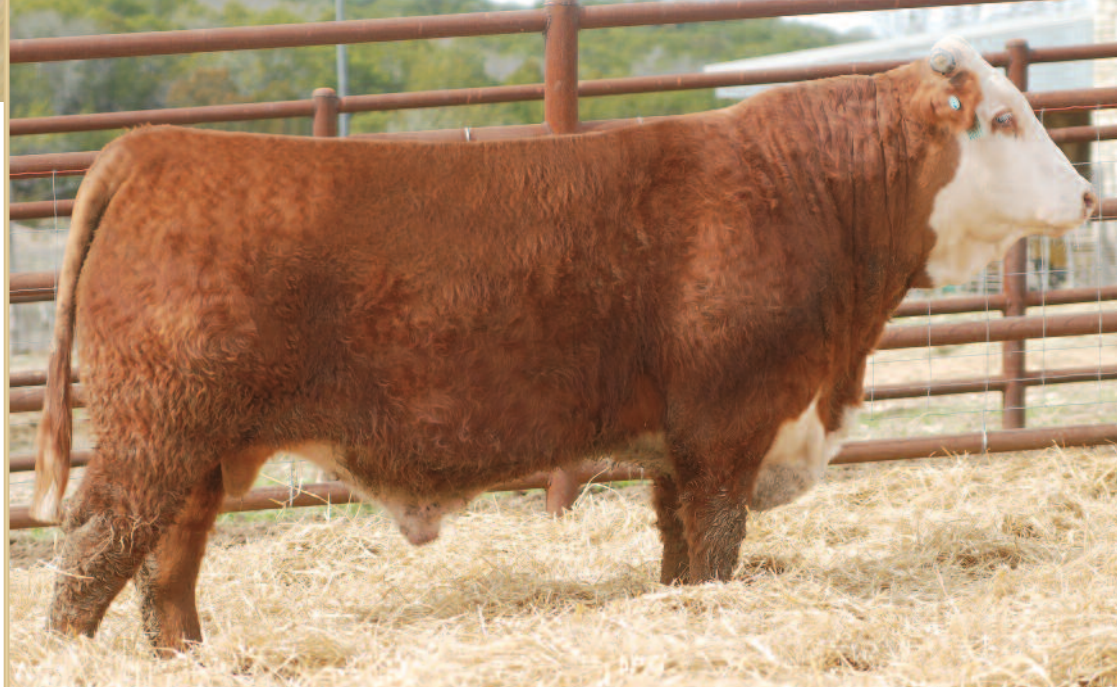
FS Advance 415B