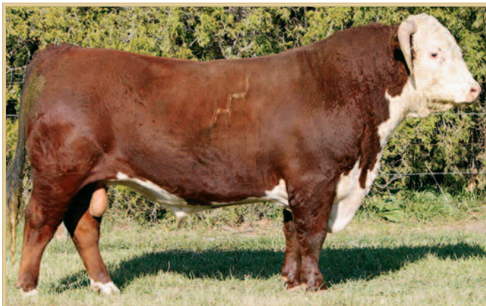
HH Advance 1069Y ET