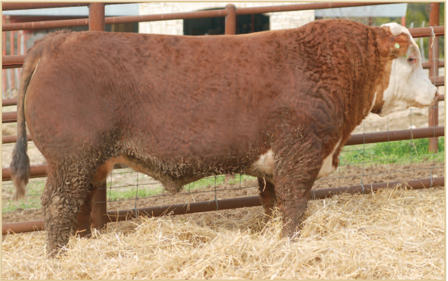
FS Advance 339A