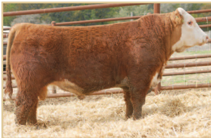
FS Advance 353A

352A is a super fancy HH Advance 1246Y son that has great curve-bending numbers. Well marked, he has extra length of body and depth of rib with tons of style and eye appeal. His dam is an awesome uddered young cow. 352A is the only registered calf sired by the 1246Y bull to date. 1246Y is a powerful, pigmented, big carcass sire that has a REA EPD of .88.