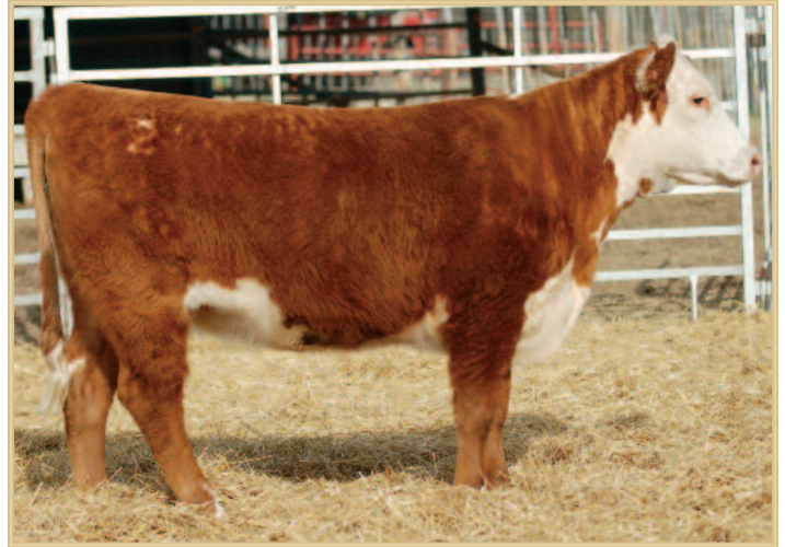
FS Miss Advance 552C

• P.E. Dec. 12, 2016 to Mar. 17, 2017 to HH Advance 5107C