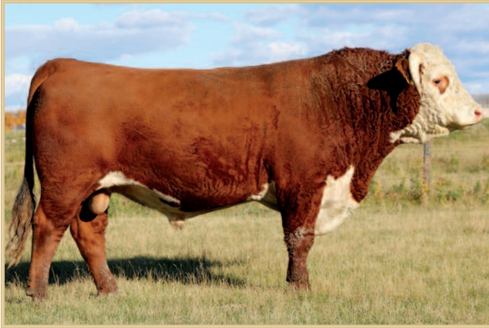
HH Advance 3006A