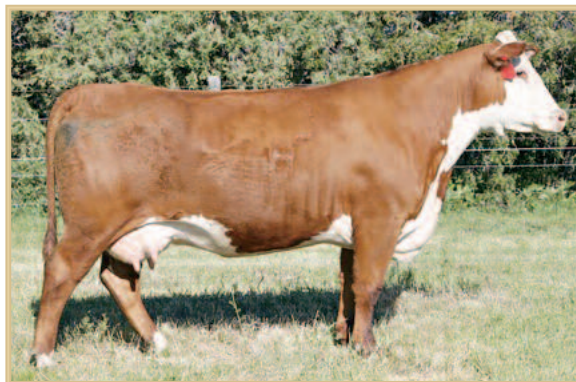
HH Miss Advance 7109T