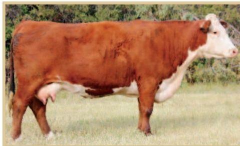
HH Miss Advance 7142T ET Dam of embryo packages A & B