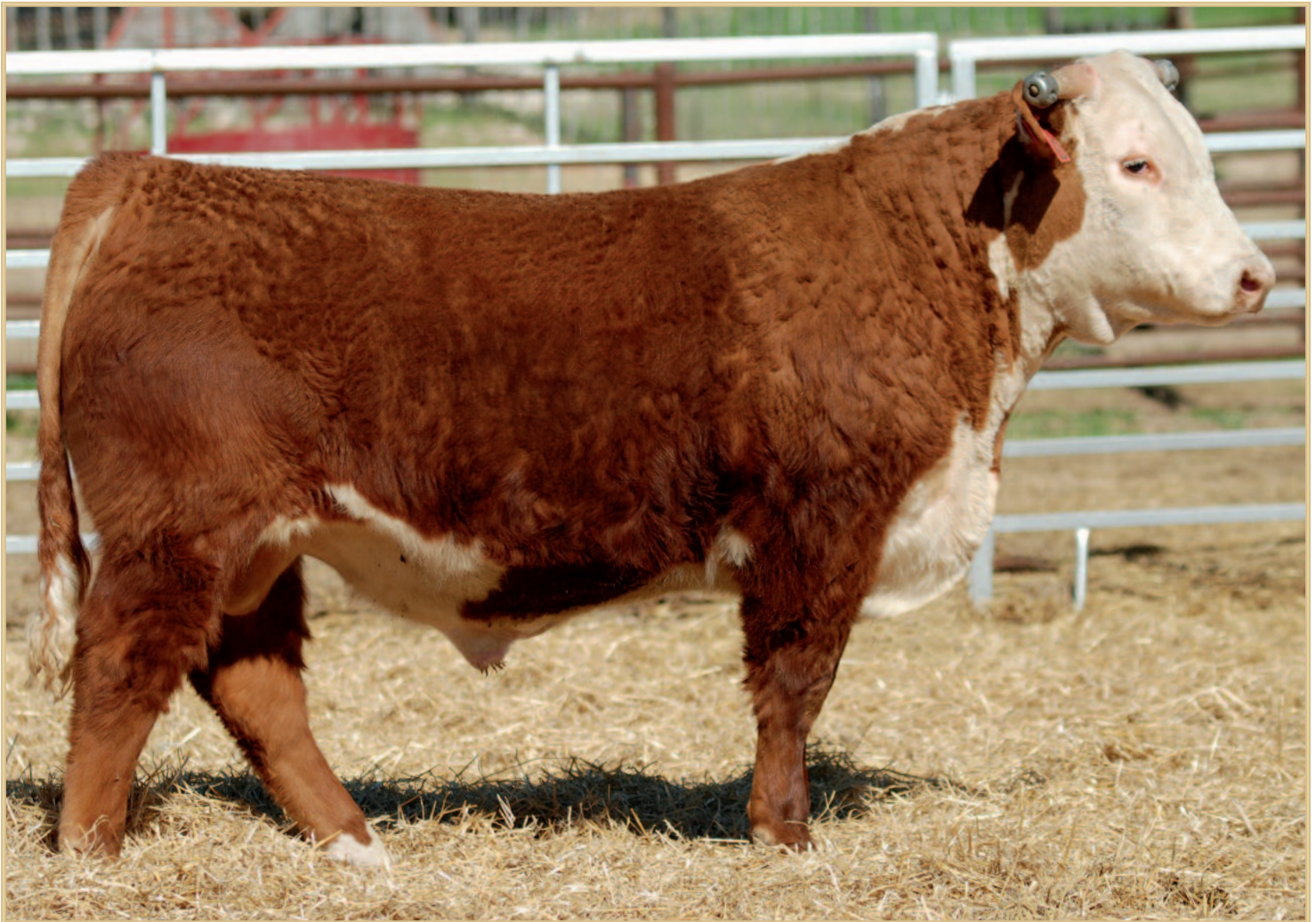
FS Advance 615D