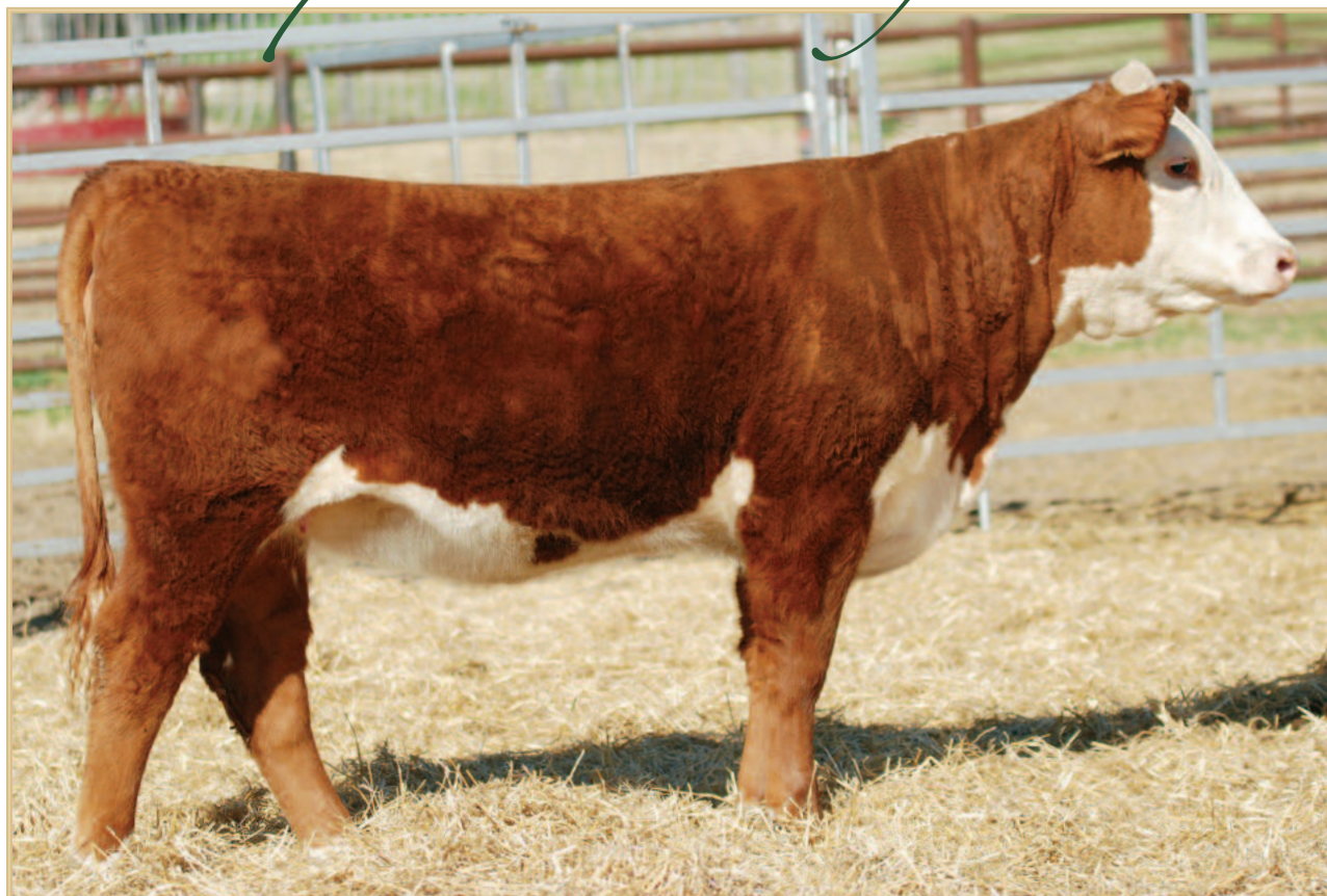
FS Miss Advance 6000D ET