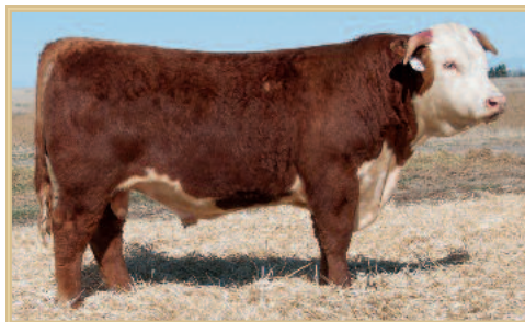
HH Advance 4052B ET Sire of buyer's choice embryo package D