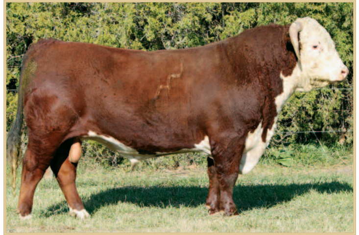
HH Advance 1069Y ET