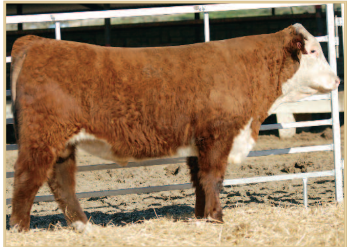
FS Advance 525C