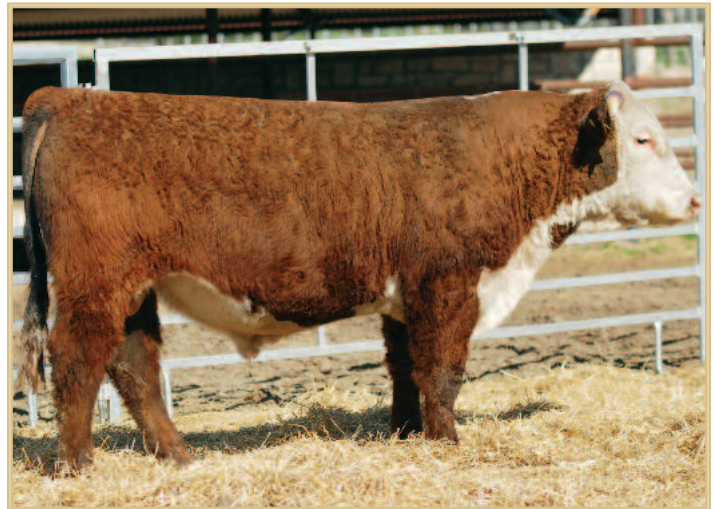
FS Advance 5021C ET