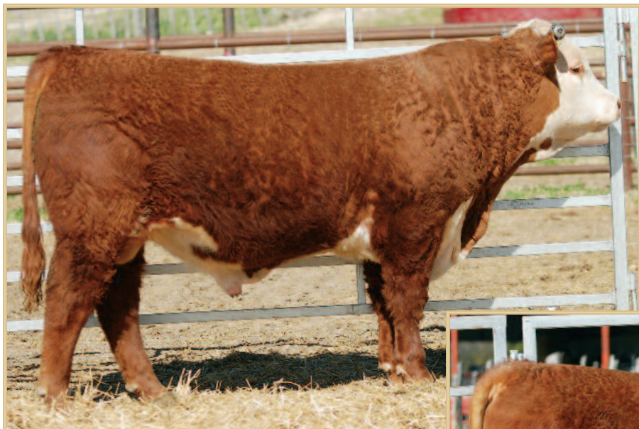
FS Advance 6002D ET