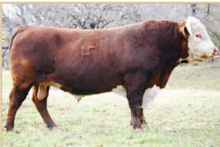
HH Advance 1081Y ET

1059Y is a beautiful fronted bull with tremendous length of body, muscle expression and eye appeal deluxe. He is very clean made, correct and 100% pigmented along with having excellent individual performance and EPDs. His dam is an extra fancy 320 daughter with a perfect udder. She is a maternal sister to Holden's 7034T herd sire.