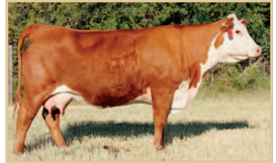
HH Miss Advance 7003T Dam of 5011C