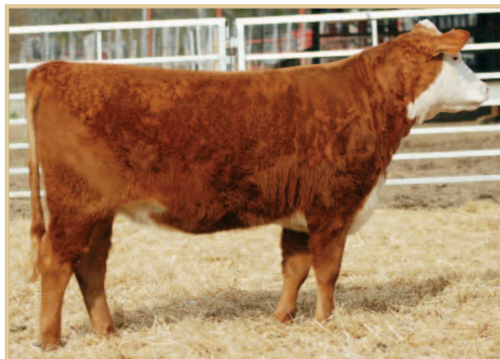
FS Miss Advance 541C