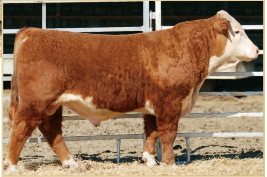
FS Advance 6005D ET