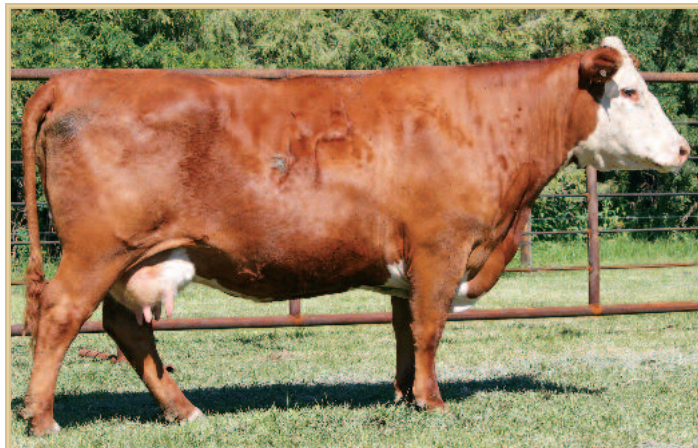
HH Miss Advance 4103P

• P.E. Dec. 13, 2016 to Mar. 17, 2017 to HH Advance 3006A