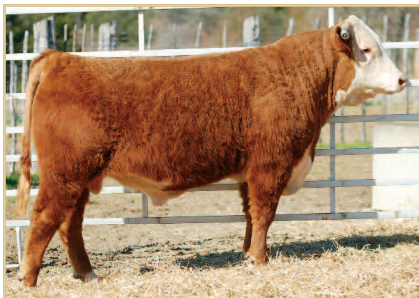
FS Advance 610D