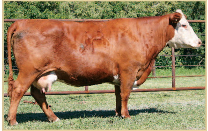
HH Miss Advance 4103P Maternal granddam of 628D