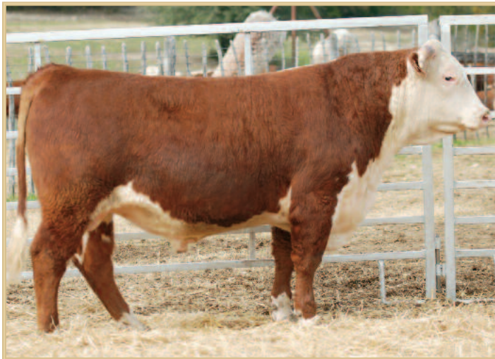
FS Advance 5013C ET