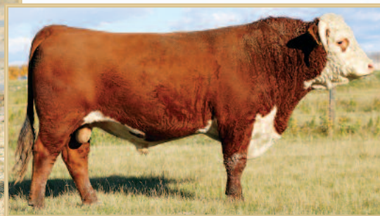
HH Advance 3006A Service sire to several of the fall bred cows