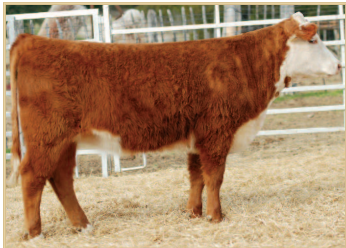
FS Miss Advance 553C

• P.E. Dec. 12, 2016 to Mar. 17, 2017 to HH Advance 5107C