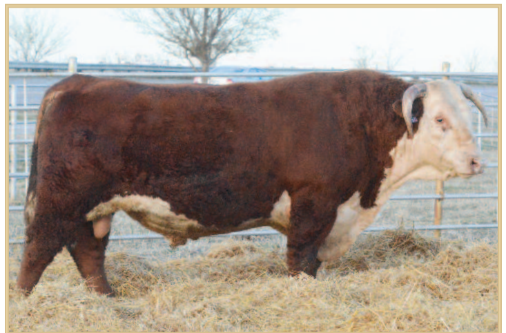
CL 1 Domino 215Z