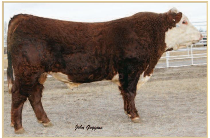
HH Advance 1246Y