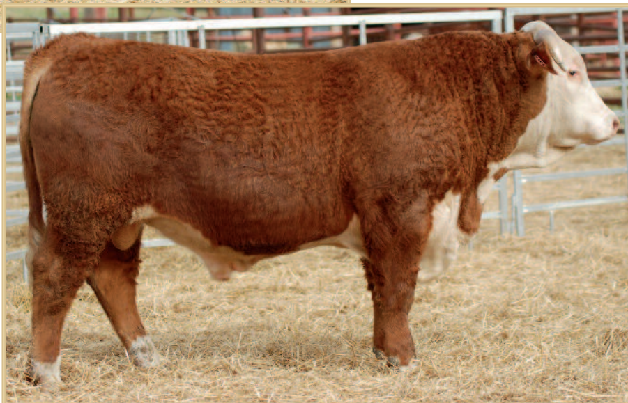
FS Advance 5016C ET