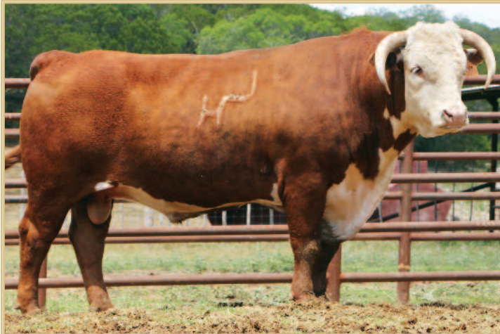
HH Advance 1059Y