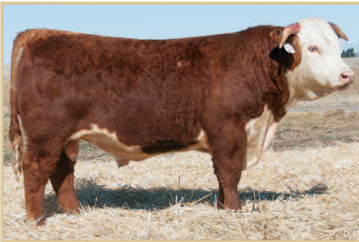
HH Advance 4052B ET

3006A was the high-selling bull in Holden's 2014 sale at $80,000 for 1/2 interest and 1/2 possession. He is an outstanding bull in every way. Long bodied, thick made, well marked and fancy made, he backs it all up with outstanding performance and ultrasound data plus great EPDs. He is backed by one of Holden's best cow families. His progeny have tremendous pigment, growth, length, depth, shape, style and eye appeal. Owned with Holden Herefords, MT