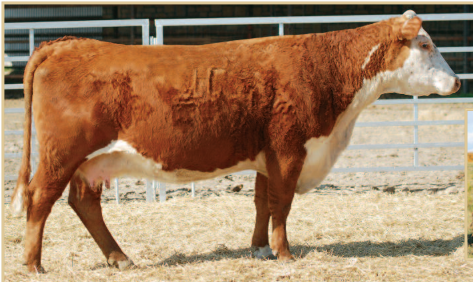
HH Miss Advance 0167X ET