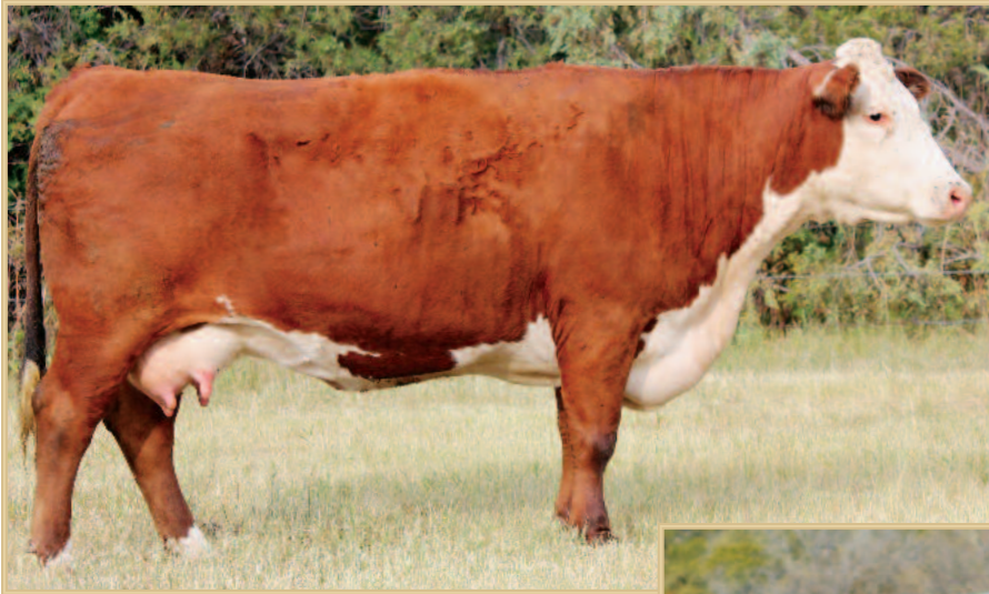
HH Miss Advance 7142T