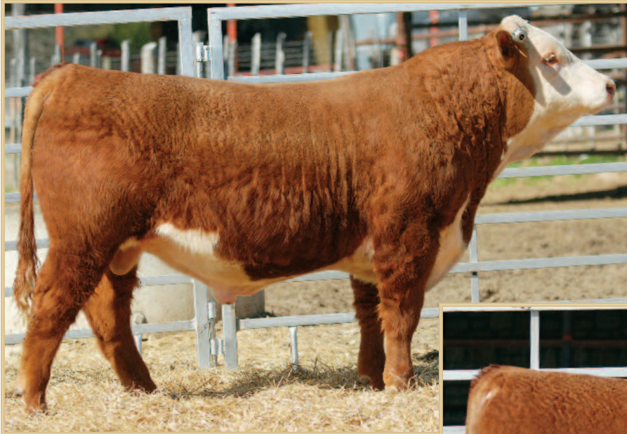
FS Advance 6004D ET