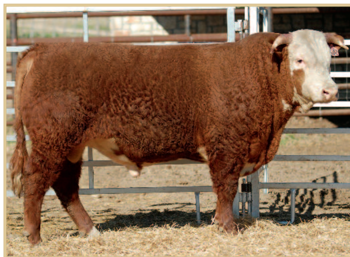
FS Advance 5024C ET