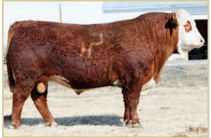
HH Advance 1098Y

• Owned with Holden Herefords, MT, and Harrison Land and Cattle, OK