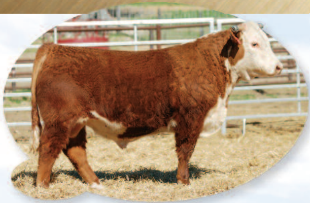
FS Advance 615D He sells!