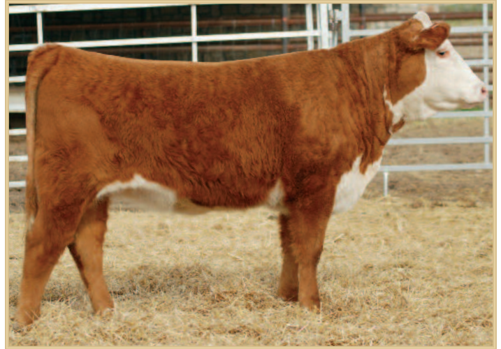
FS Miss Advance 538C