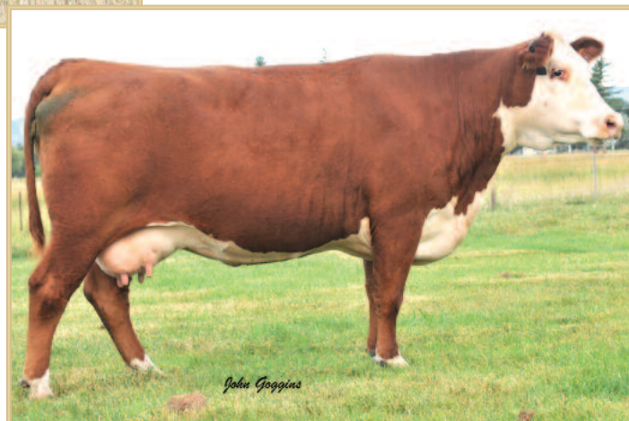
CL 1 Dominette 5142R Dam of 2171Z

Lot 0232X {DLF,HYF,IEF} HH Miss Advance 0232X Cow – Feb. 7, 2010 – Reg. 43073866 {DOD}