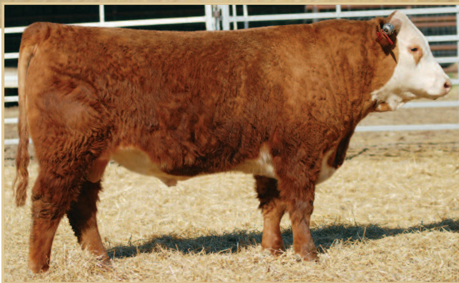
FS Advance 612D