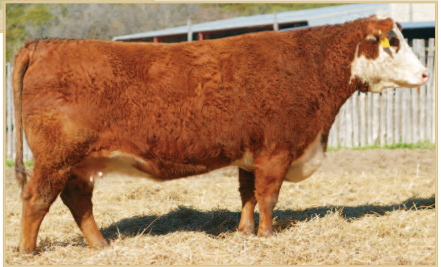
HH Miss Advance 9028W ET

Here's a great opportunity to choose a top donor to flush to the bull of your choice and tie into some of our most elite genetics. We are offering the right to flush the buyer's choice of one of these four outstanding Flying S donors.