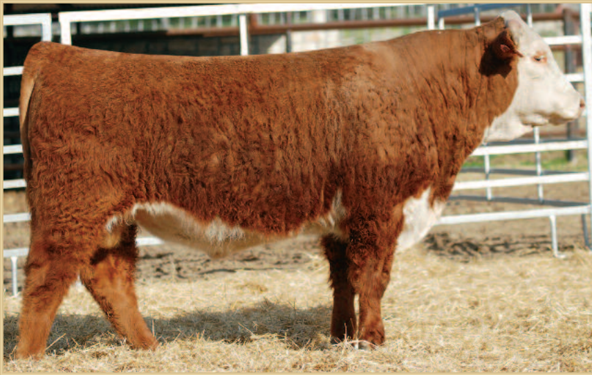
FS Advance 533C ET