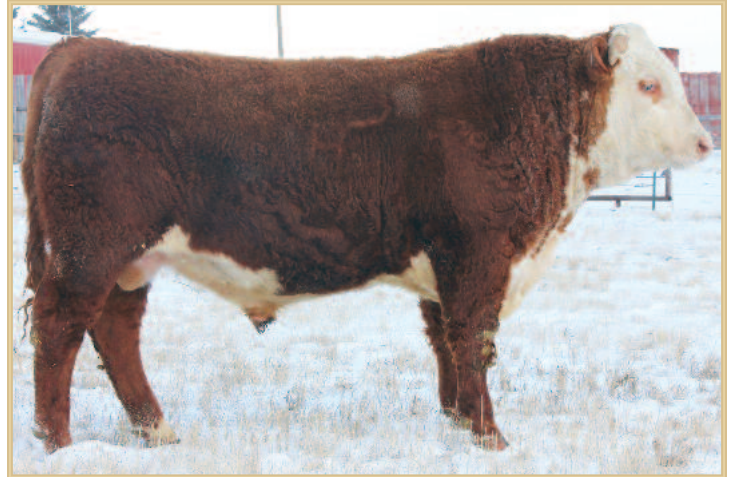
HH Advance 2125Z

2125Z is an outstanding bull that really brings it all together. He is goggle eyed and heavily pigmented, long bodied and deep sided and has great muscle expression. He is very sound made and has lots of eye appeal. He has a great set of EPDs and had an 80 lb. actual BW. His dam is a perfect uddered young cow with goggle eyes, and his granddam is the 4016P cow that sold for $37,500 in Holden's 2010 Cow Sale. His great granddam is the great 0023K cow that was a superior donor for Holden.