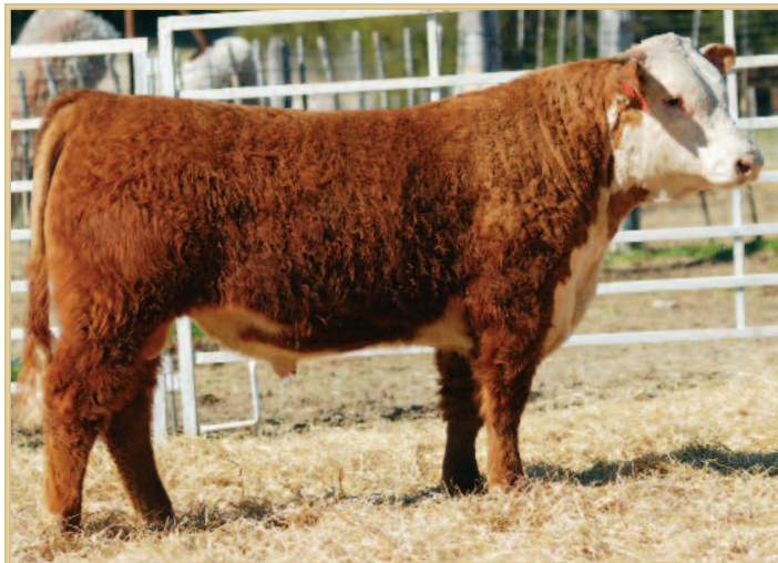
FS Advance 616D