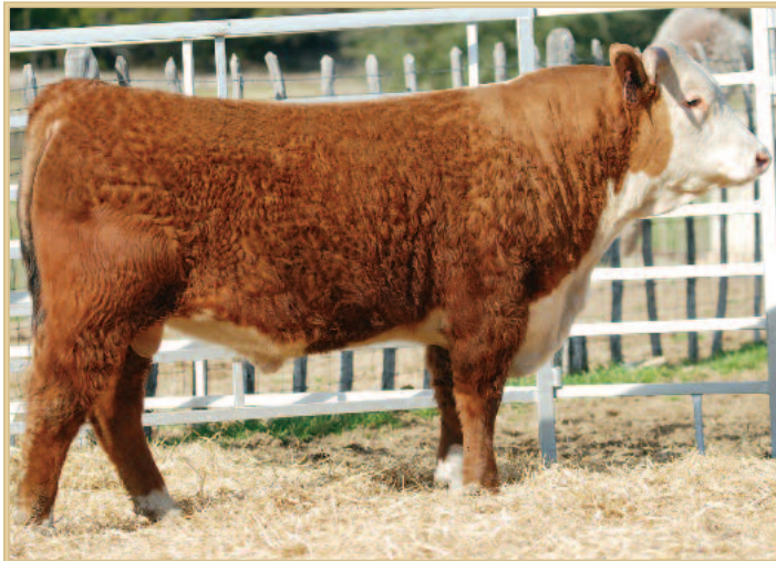
FS Advance 523C