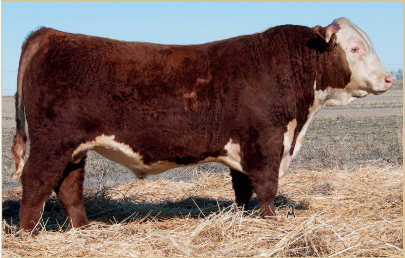
HH Advance 5107C ET

Service sire to the fall bred heifers selling