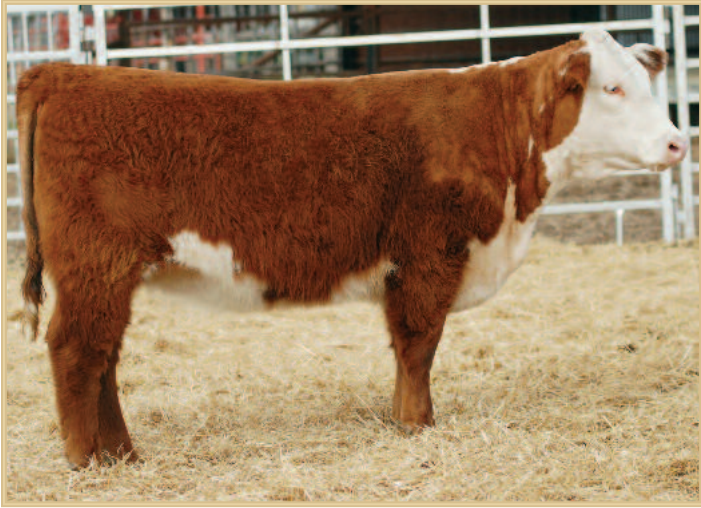
FS Miss Advance 559C