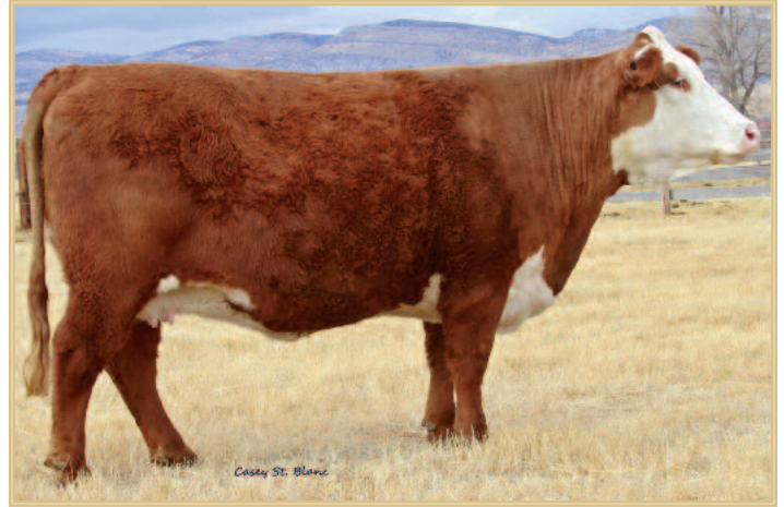
CL 1 Dominette 606S 1ET Dam of 608D