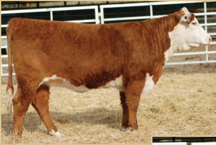
FS Miss Advance 5011C ET