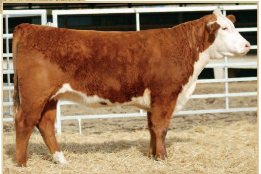
FS Miss Advance 5017C ET