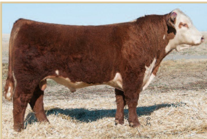
HH Advance 4101B

Outstanding growth, maternal and carcass EPDs in this well marked, good pigmented, extra thick 297Z son out of the Holden 9100W donor cow. 4052B is well marked, square hipped, big topped and really nice fronted. He is complete in his makeup and has a pedigree loaded with great females. His progeny exhibit pigment, shape, length and style.