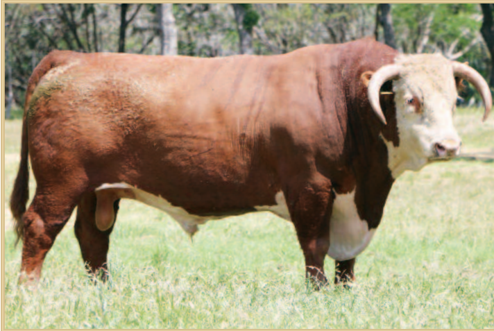
HH Advance 0081X ET