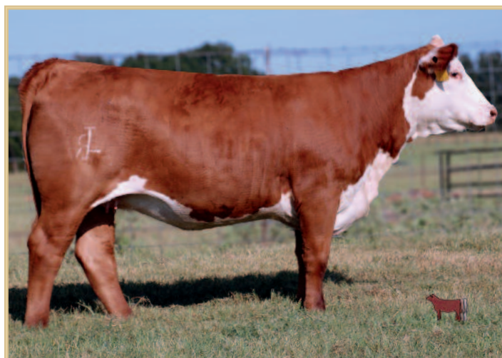
HH Miss Advance 5239C ET