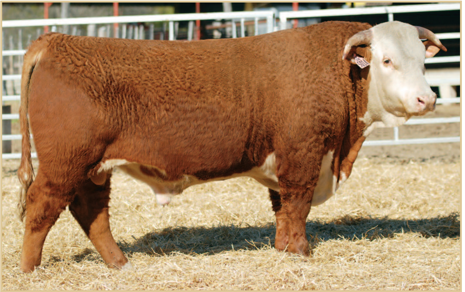
FS Advance 5014C ET

Selling three top herd bull prospects from the 215Z x 1072Y flush!