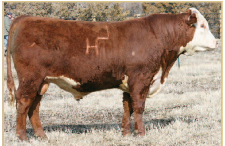
HH Advance 2214Z ET