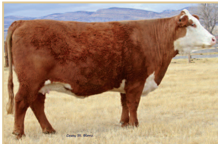
CL 1 Dominette 606S 1ET Dam of 426B & 427B