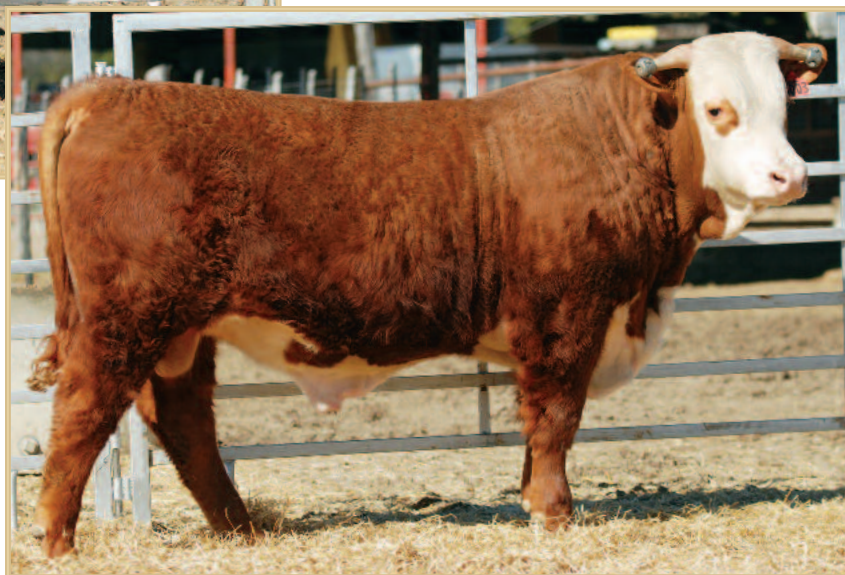
FS Advance 6003D ET