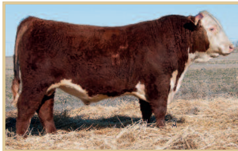
HH Advance 5107C ET Sire of embryo packages A & B