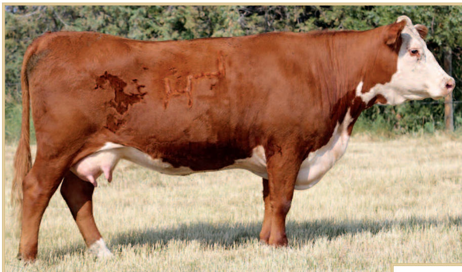
HH Miss Advance 0232X