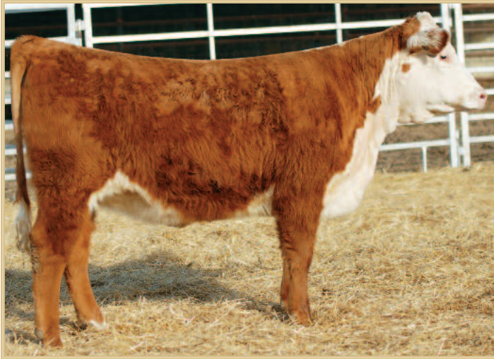
FS Miss Advance 602D