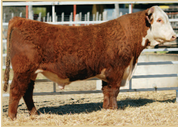
FS Advance 554C