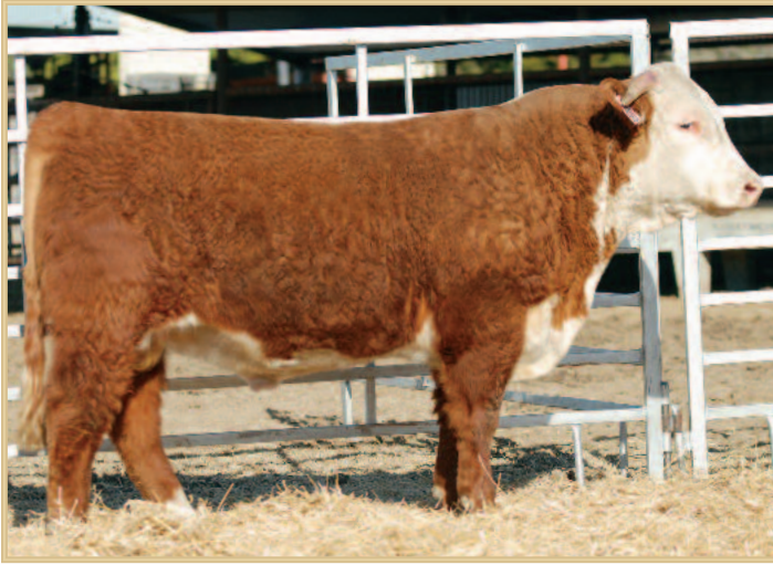
FS Advance 527C