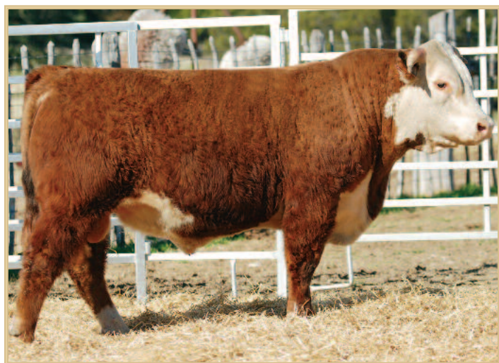
FS Advance 5023C ET