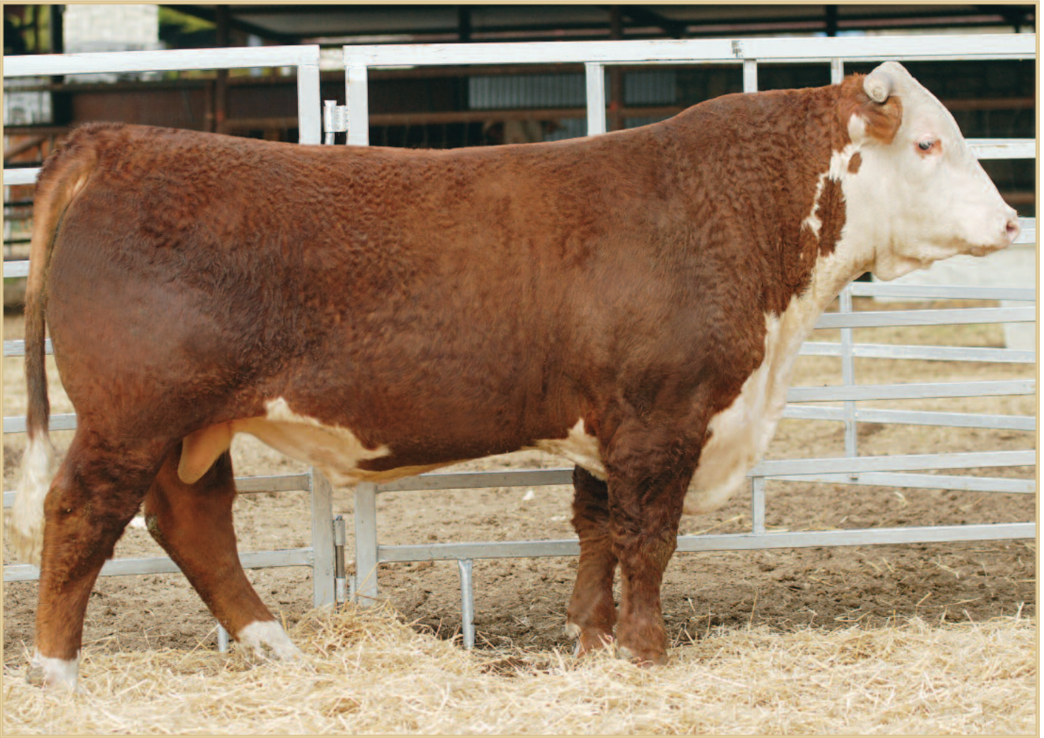
HH Advance 5387C ET