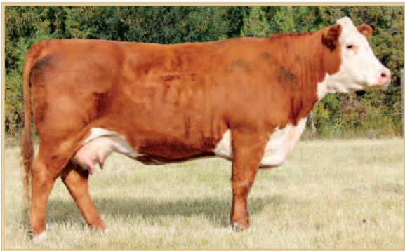
HH Miss Advance 8064U ET Dam of 5017C