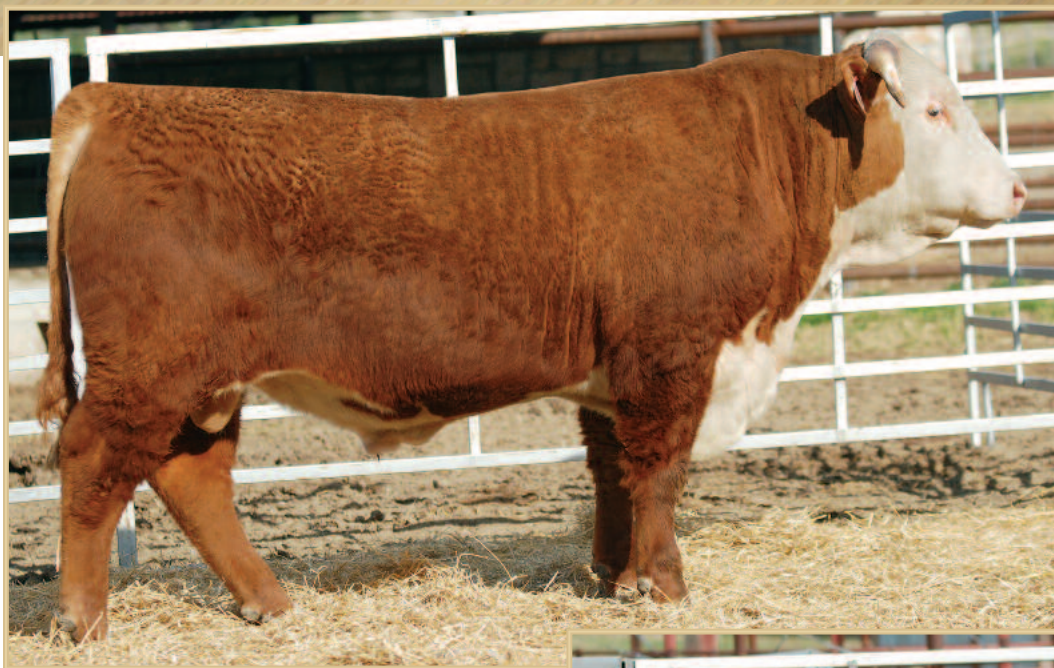
FS Advance 5015C ET